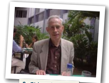
Dr. Richard Swinburne

Ranking among the world's leading Christian philosophers (along with Drs. Alvin Plantinga and Nicholas Wolterstorff, who have previously lectured for the Institute), Dr. Richard Swinburne comes from Oxford University to speak November 10 at 7:00 p.m.